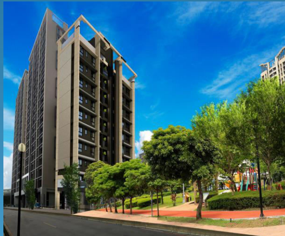
Ta Jiang Beauty tree Project

Presentation for Investor Conference December 21, 2023